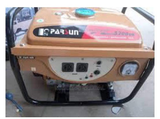
Figure 2: Showing the parson generator