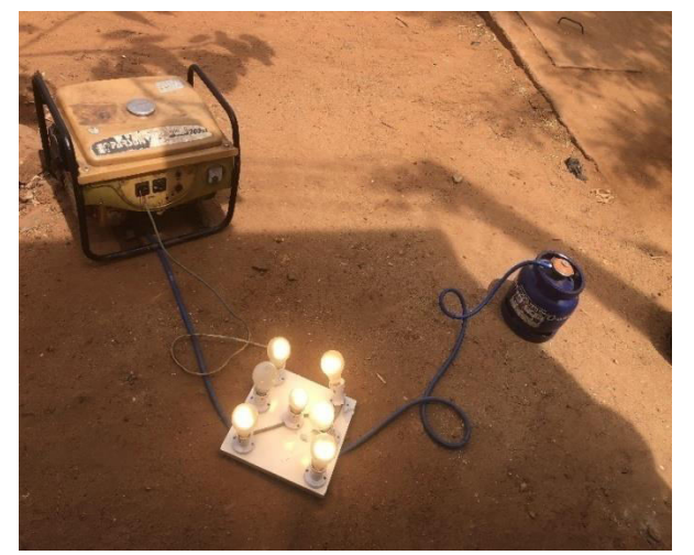
Figure 5: Modified generator running on biogas with load

A hybrid carburetor was used on the generator. It works like any carburetor in a generator with the difference being that this type of carburetor allows one to run a generator with either cooking gas or petrol. A hybrid dual fuel carburetor was attached to the manifold of the spark ignition engine generator to enable the use of biogas as fuel. The hybrid carburetor allows instantaneous switching to gasoline fuel without any other physical modification for the production of electricity. The current and voltage was measured using ammeter and voltmeter respectively. A load was connected to the generator and fuel consumption (Biogas) was measured at different time interval, the overall efficiency of the generator was evaluated.