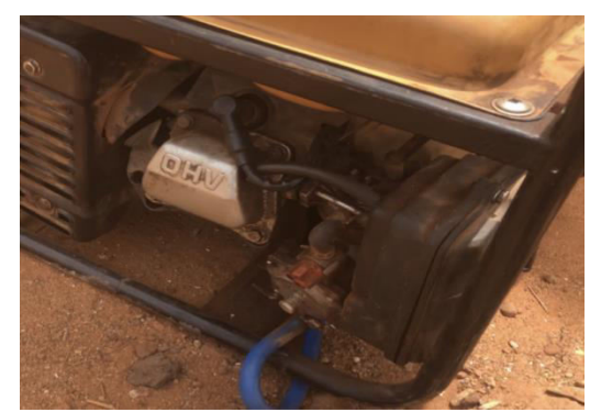
Figure 4: Modified generator