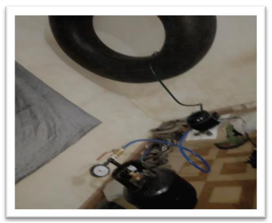
Figure 1: Biogas Compression

displacement. Additionally, a pressure gauge is used to monitor and measure the pressure leaving the compressor, preventing potential explosions. By compressing the scrubbed biogas, its energy density is increased, making it suitable for storage and transportation.